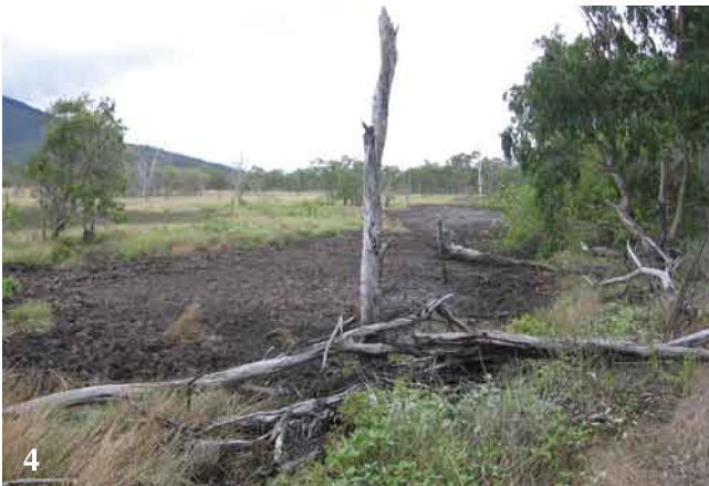
Photo 4: Selected site for wetland rehabilitation in the Cungulla inter-dunal wetlands system

At the Buralga property, work on the ground focused on wetland enhancement, weed removal and revegetation . Through a partnership with Conservation Volunteers Australia (CVA), Better Earth teams worked on the site for a total of three weeks over a period of six months. This included extensive hand weeding and herbicide application for the control of several weed species (lantana, chinee apple and leucaena), site preparation, revegetation, mulching and maintenance of the site. The CVA team planted several hundred native trees, which were mulched and watered before the wet season.