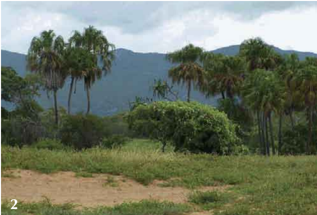
Photo 2: Remnant Livistona palm forest and cleared sand ridge near the edge of Cromarty wetland