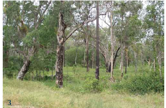
Photo 3: Mature Melaleuca dealbata wetland complex