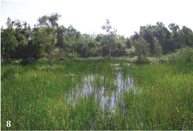
Photo 5–8: Sites after wetland rehabilitation in the Cungulla inter-dunal wetlands system