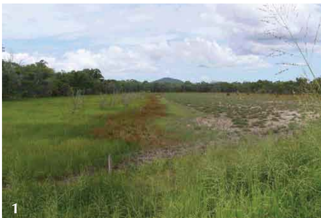
Photo 1: Transition zone between Cungulla inter-dunal freshwater wetlands and Cromarty salt marsh

It is hoped that this pioneering work will create interest and momentum in the community, and will encourage others to follow the lead of these property owners.