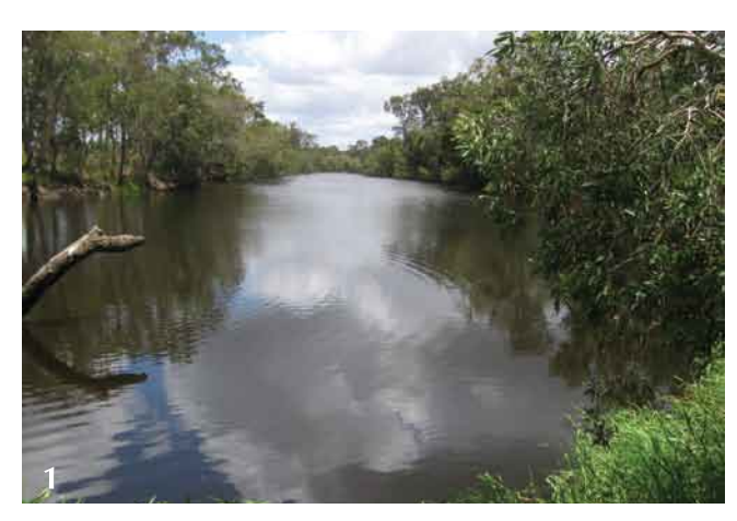
Photo 1: High-value deepwater lagoon in the lower reaches of Splitters Creek, historically a barramundi habitat

Despite overall success, sustaining momentum remains an ongoing challenge. It is also essential to make progress towards other outcomes such as tenure-based protective management (e.g. reserves) and local council planning initiatives.