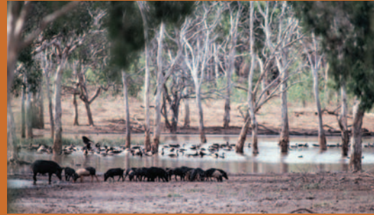
The feral pig Sus scrofa can damage all types of wetlands.

The fox and the rabbit are declared as Class 2 pests under the Queensland Land Protection (Pest and Stock Management) Act 2002 and under this Act land managers are required to control these pests on land under their management.