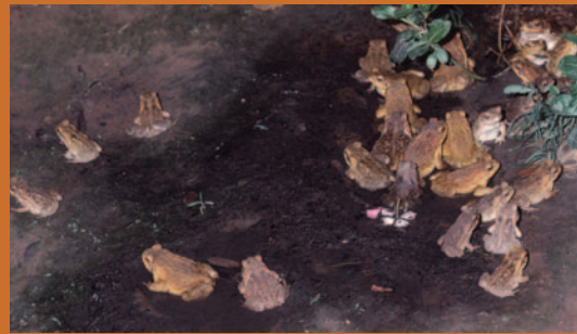
The cane toad Rhinella marina

The feral pig Sus scrofa is a pest species that can cause impacts on crater lakes. Feral pigs can cause significant damage to lake margins and can predate ground-nesting birds and other animals as well as carry disease. The species is declared as a Class 2 pest under the Queensland Land Protection (Pest and Stock Management) Act 2002 and under this Act land managers are required to control feral pigs on land under their management. In recognition of the severe impact of feral pigs on the Australian landscape, predation, habitat degradation, competition and disease transmission by feral pigs has been listed as a key threatening process under the Commonwealth EPBC. Under the Act the Australian Government, in consultation with the states and territories, has developed a Threat Abatement Plan which outlines control techniques and stakeholder roles and responsibilities. This plan can be viewed on the Australian Government's Environment website < www.environment.gov.au >.