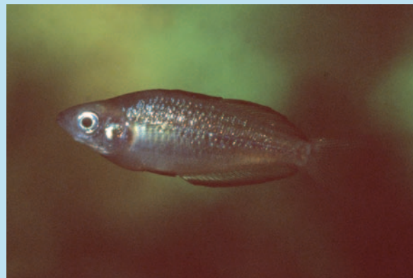
The Lake Eacham rainbowfish Melanotaenia eachamensis .

In 1987, surveys indicated that the species no longer occurred in the lake. It was thought to be the first freshwater fish species in Australia to become extinct in the wild. The main cause is likely to be the unofficial release of translocated native fish predators into the lake such as mouth almighty Glossamia aprion , sevenspot archerfish Toxotes chatareus , bony bream Nematalosa erebi and barred grunter Amniatabe percoides . These species were not found in the lake until the rainbowfish disappeared. Despite a number of reintroduction attempts, the Lake Eacham rainbowfish remains absent.