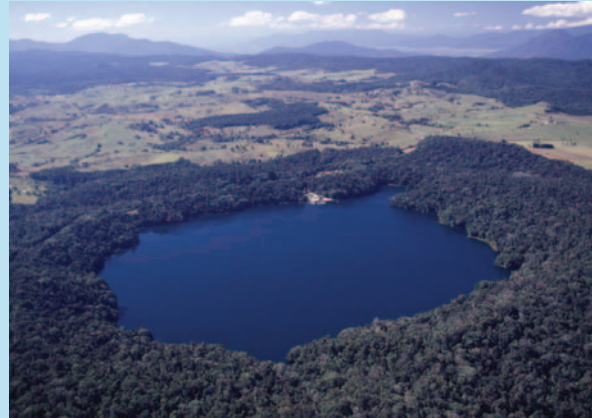
Lake Barrine in the Crater Lakes National Park.

The rainforest around Lakes Eacham and Barrine contains large kauri pines Agathis spp., descendants of species which dominated the Tableland forests for thousands of years. Lake Eacham's rainforests demonstrate how soil type affects vegetation. On less fertile soils, the rainforests are simpler with more uniform trees and few buttresses.