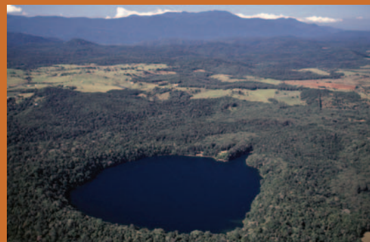
Lake Eacham in Far North Queensland.