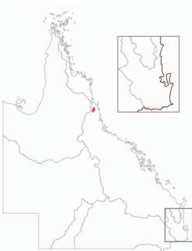
Map showing the distribution of coastal and sub-coastal non-floodplain rock lakes in Queensland; grey lines indicate drainage basins.

Some crater lakes are permanent while others are seasonal to intermittent lakes or marshes. They range in size from small ponds of less than one hectare to larger lakes of over 100 ha. Because of the way the volcanic mounds or cones are formed, in Queensland these lakes are usually between 300 and 750 m above sea level.