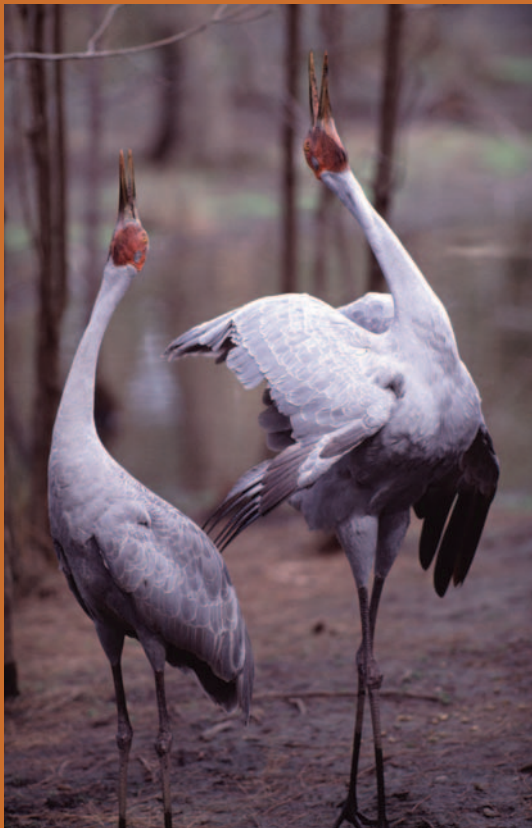
The brolga Grus rubicunda .

SOME wildlife is endemic to crater lakes or the ecosystems surrounding them due to their isolation.