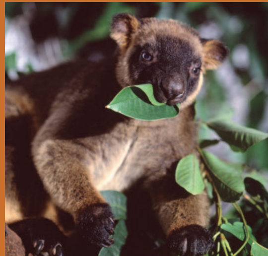
The Lumholtz's tree-kangaroo Dendrolagus lumholtzi . Photo: DERM